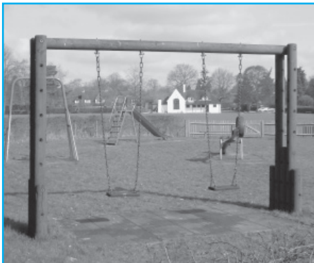
The Glebe playground

Efforts of the Speedwatch volunteers are successfully reducing average speeds in the village. Letters are sent to all those exceeding the 30 mph limit with further action for repeat offenders. During the November – February period, 52 offenders were noted. The group would like more volunteers so checks can be carried out more frequently. Speed checks can only be carried out within the 30 mph area. More volunteers mean additional roads can be covered as soon as this area is extended. Please contact PCSO Clive for more details.