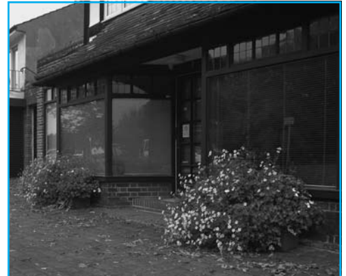
Flower tubs installed at The Crescent by Woldingham Parish Council