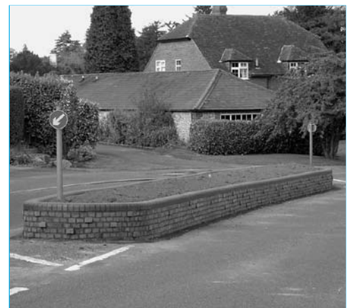
The rebuilt Slines Oak Island - ready for planting

Earlier this year it became apparent that the island was deteriorating fast and could become a safety hazard as well as an eyesore. We did of