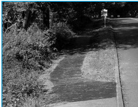
The rebuilt footpath alongside 2nd fairway North Downs G. C.