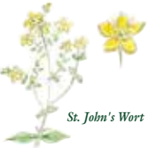
St. John's Wort