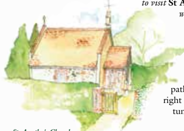
St. Agatha's Church

G Follow path, bearing left around woodland margin and through gate. (A detour to the right to visit St Agatha's Church is well worthwhile). Turn left downhill then bear right at junction. Continue downhill and take narrow footpath on the right. Follow path downhill then turn right over railway tunnel entrance.