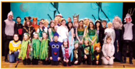
The Little Mermaid

impacted by the covid pandemic and the financial loss sustained jeopardised the ability of the panto team to stage Rapunzel in 2022/23.